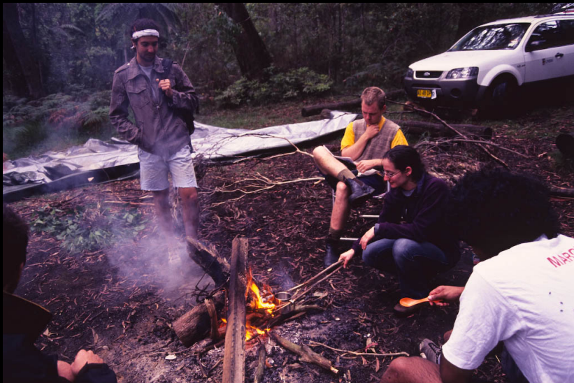
Sunday morning sobering