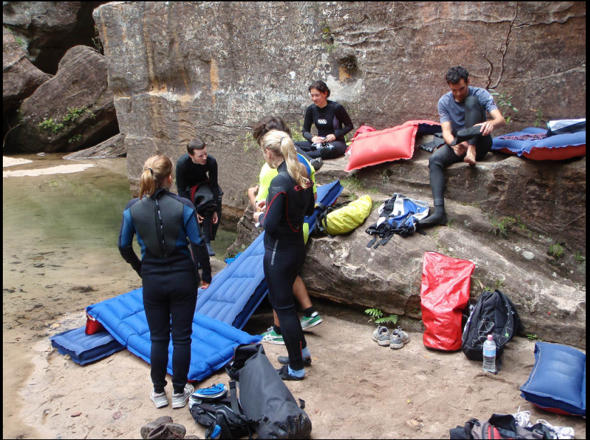
Making a mess